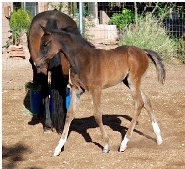
Taliid Fa Saafaddan Fa Lothar Azaba x Aareebah