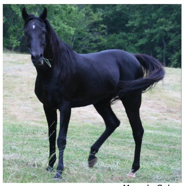
Masada Sabar