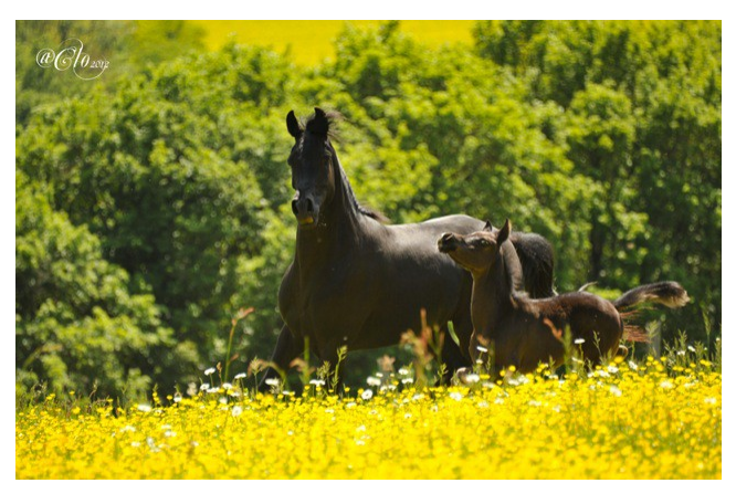
Maarena Satins Image and his deceased dam, BL Maaroufas Image

We have also made the decision to ET Bint Fay Amy (Mahrouf x Fay Amy) 1995 Grey mare this fall or next spring.