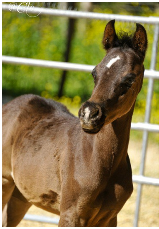
Maarena Satins Image