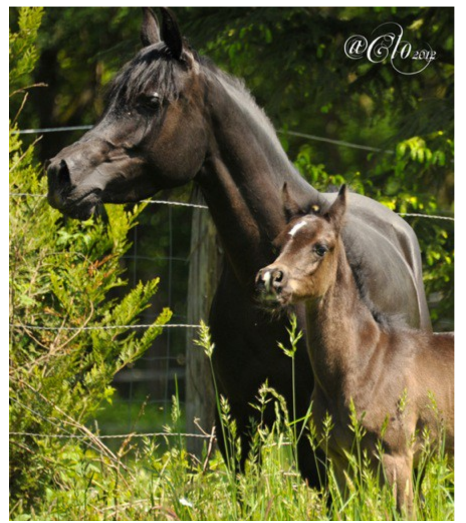
BL Maaroufas Image Survived by her only foal, a 2012 colt

(Mahroufs Image x Sunnyru Maaroufa) 2008 Black Mare