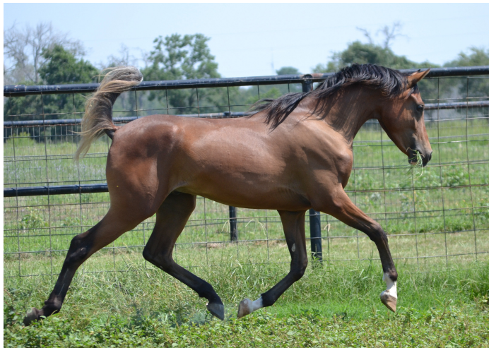
Faaroh (Almoraima El Cid x Fa Maarlina) 2011 Bay Colt

might accomplish with this show crazed stallion. Hopefully, Sotamm will be back in the ring either late this year or in 2013.