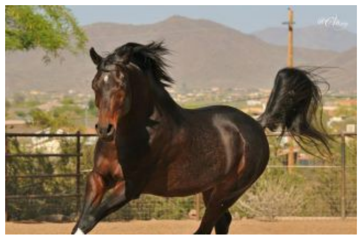
Serr Kazmeen in May 2012