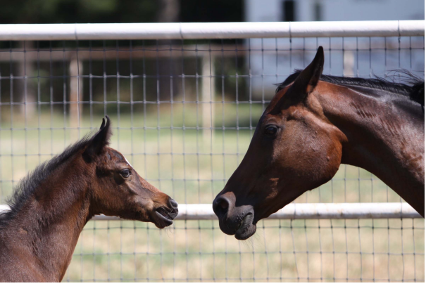
Hamir and his dam, Mahr Rih