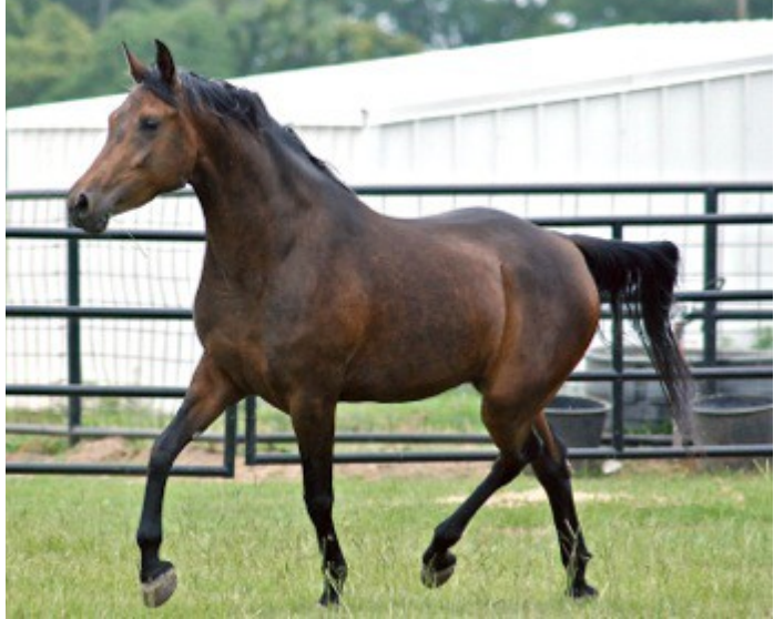
Proud Dam, Aareebah