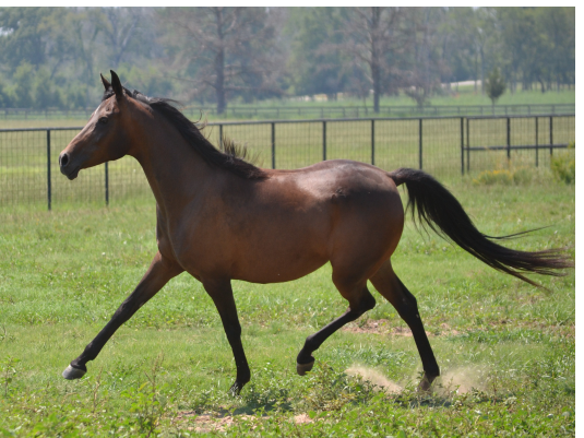
Serabahs Sable Gem 2002 Bay Mare

effort to perpetuate the legacy of the BAHF's great herd