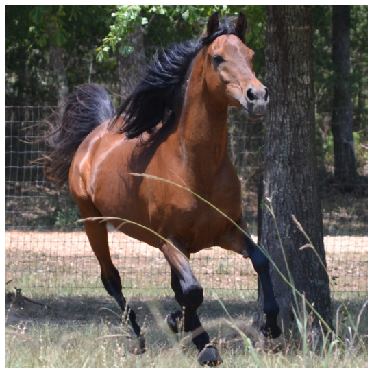
Almoraima Capitan 1991 Bay Stallion

This line breeding is our first concentrated