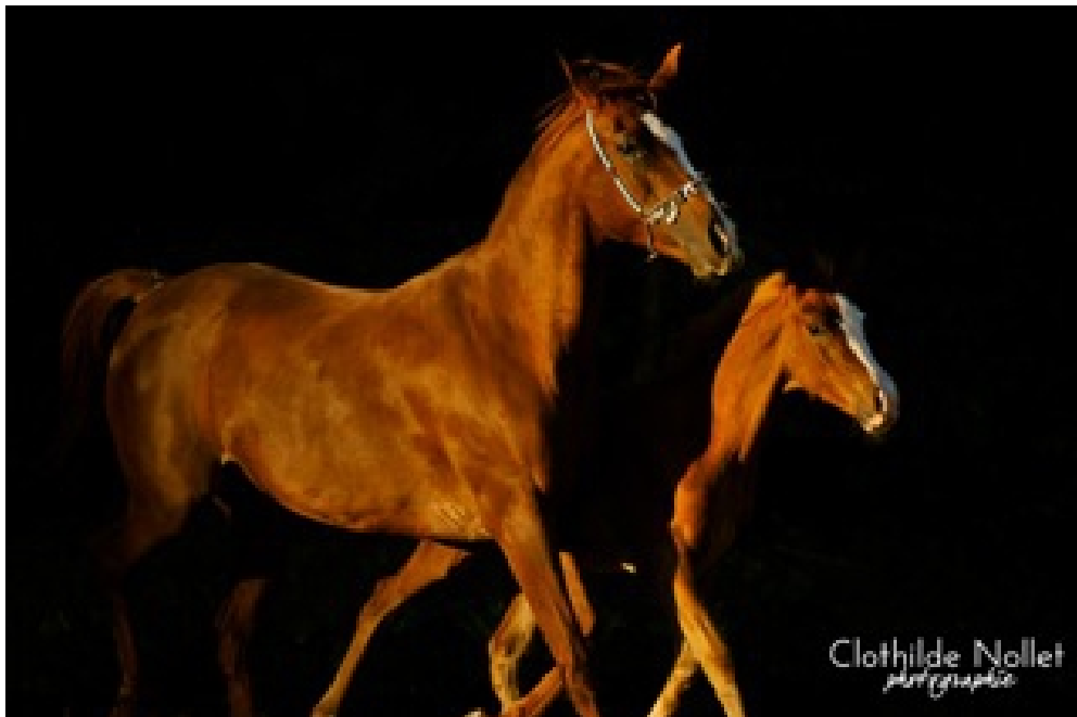
Fa Daahlina with her colt, Maarena Battal