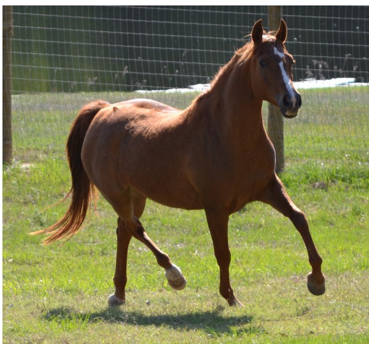
Moulin Rouge Rou

(x Almoraima Aurora) 2001 Chestnut Mare Straight Babson Egyptian Arabian