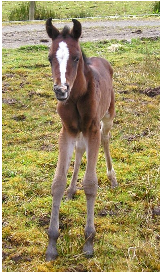
Prince's Filly (x Manara Fa Habba)

Hoping Prince will have his first Vlacq Grandchild late summer, watch this space!