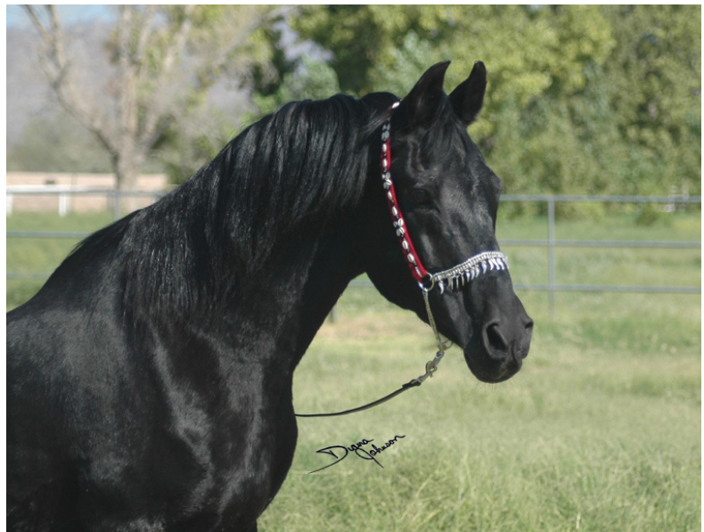
Ru Fadl Esswad as an aged stallion