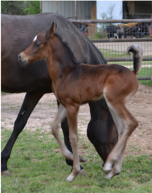
Capitans Sable Legacy