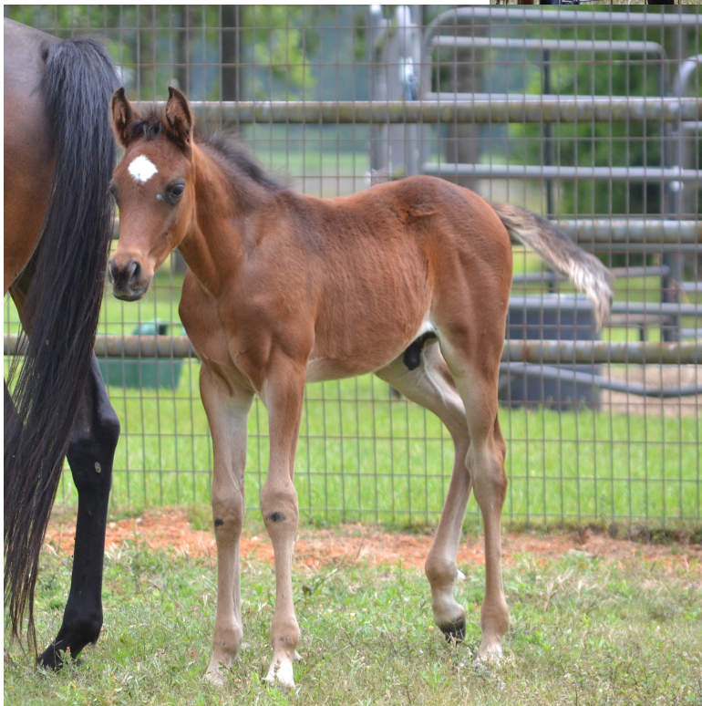
Capitans Sable Legacy