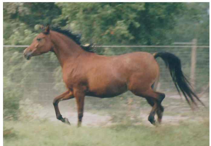
Tariifah Bint Aurora