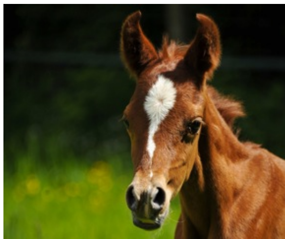
Fa Daahlina's last son, Maarena Dubaaj

mind and athleticism. She was the kids favorites and one of my dearest friends. Just before she had her accident, we had bought her daughter who is all Babson with one line to Ansata Ibn Halima, she is her only descendant and she gave us a SE/SO filly who is the only tail female replacement of Bint Fay Amy.